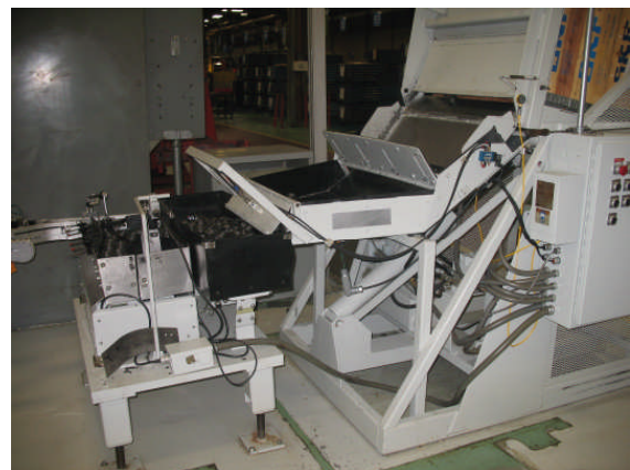
Dumper, manual adjust reduction pan, "on demand" Metered part supply to Dyna-Slide Feeder