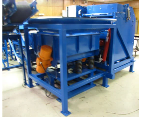
HD Pan Feeder- Meters bulk supply of large parts