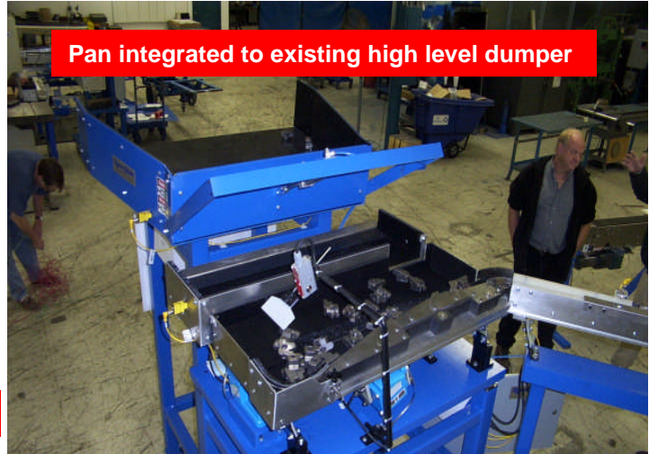
Pan integrated to existing high level dumper