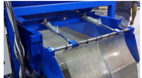
Automatic, Bottom Pivot Flow Control Gate