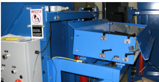
Intermediate Reduction Pan w/ Adjustable Side Guides and Flow Gate Absorbs impact load-meter parts/materials.