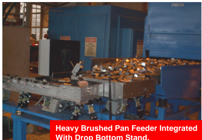
Heavy Brushed Pan Feeder Integrated With Drop Bottom Stand.