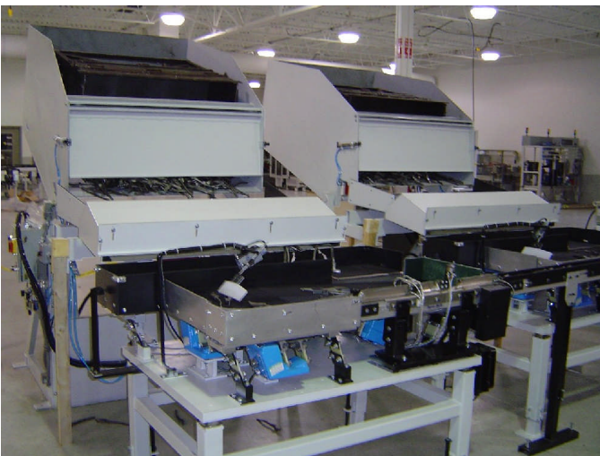
Multiple "smart dumpers" w/ flow control pans in operation. Integrated to robot assembly cell.