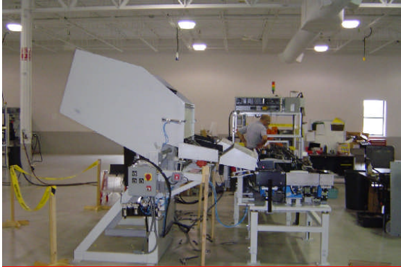
Reduction pan feeder integrated to dumper