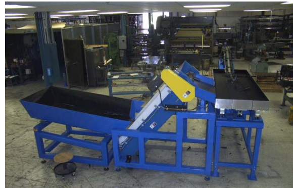
20 Cu Ft Automotive Parts fed from Live Hopper, hinge steel Belt conveyor to feeder/orientation system