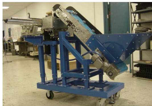
3 Cu Ft Hopper, Integrated to Feeder on Portable Base