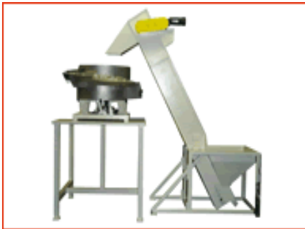
Sanitary Low Level Hopper & Belt Feeder