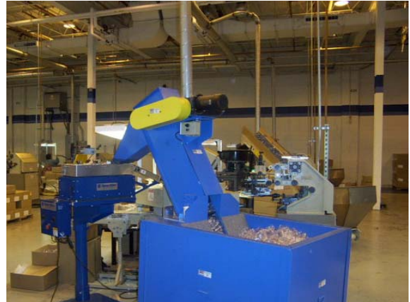
Low Level Hopper - Fasteners