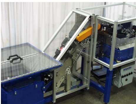
Medical Assembly Cell w/ Enclosed Low Level Hopper and Incline Belt Feeder