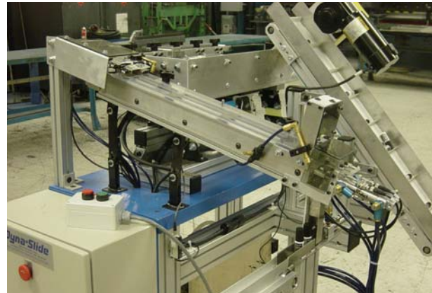
Cosmetic Package Low Level Hopper & Belt Feeder

A complete range of belt surface styles & types, cleats, accordion side walls, side walls, pans, top covers, liners gravity & live wall hoppers and enclosures.