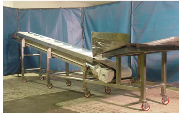
Super Sanitary Low Level Hopper & Belt Feeder

Controls: Standard Nema Enclosures available w/ start/stop, e stop, servo, indexing and variable speed controls