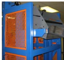
Bulk Material Supply (Intelligent Skip Hoist)