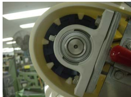
Positive Belt Tracking