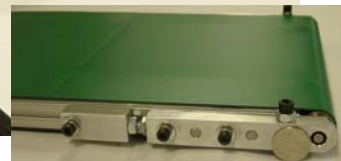
1" Bed Depth