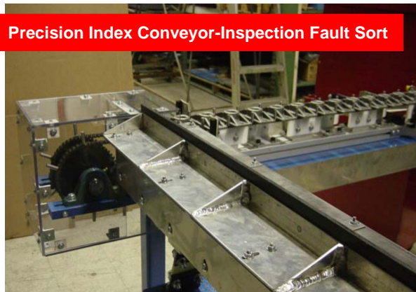
Precision Index Conveyor-Inspection Fault Sort