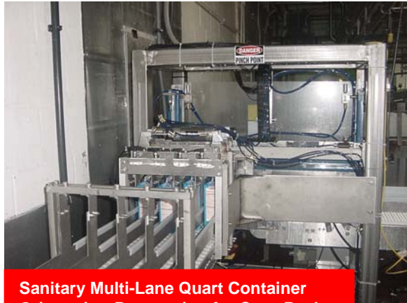
Sanitary Multi-Lane Quart Container Orientation-Preparation for Case Packer