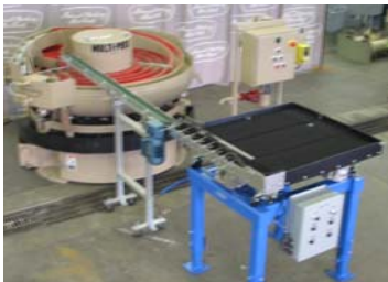
On Demand Part & Materials Supply