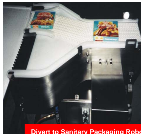
Divert to Sanitary Packaging Robot