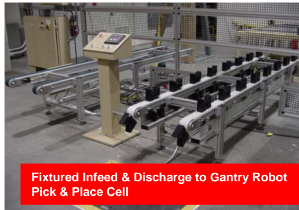
Fixtured Infeed & Discharge to Gantry Robot Pick & Place Cell