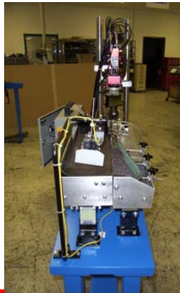
Dyna-Slide Feeder w/ Pick & Place For Assembly Dial Loading