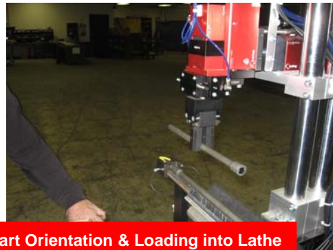
Part Orientation & Loading into Lathe