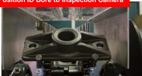
Position ID Bore to Inspection Camera