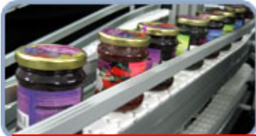
Transport & Accumulation