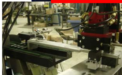
Active Tooling- Part Orientation