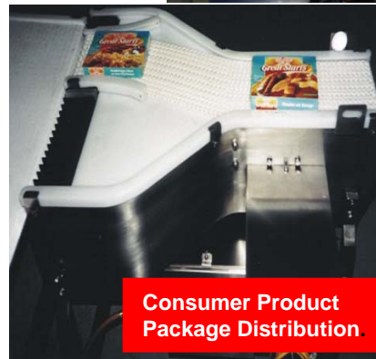
Consumer Product Package Distribution.