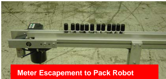
Meter Escapement to Pack Robot