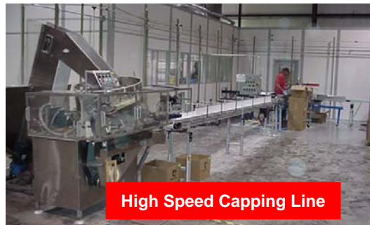
High Speed Capping Line