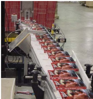
Books Fed to High Speed Sort x Bar Code