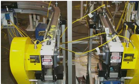
Part Orientation for Robot Pack Off System