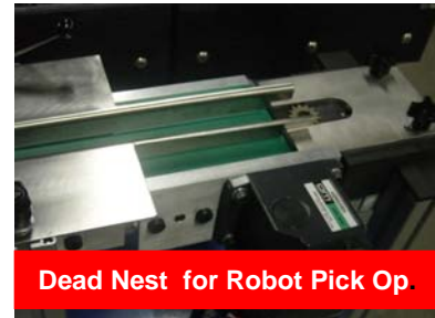
Dead Nest for Robot Pick Op.