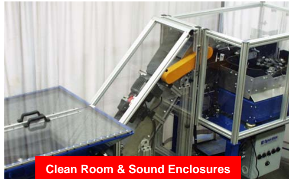
Clean Room & Sound Enclosures