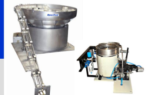
Flexible industrial solutions for automatically feeding parts, package or materials.

CDS LIPE is a manufacturer of industrial automation feeding and orientation components, equipment and systems. Our application engineering group has a team of experts. Allow us to provide you with a cost savings or reduce working conditions for your most labor-intensive applications. We are so confident in our professional services and the quality and performance of our products we are pleased to offer Dyna-Feed components, equipment and Dyna-Feed based automation processes with an 18-month warranty.